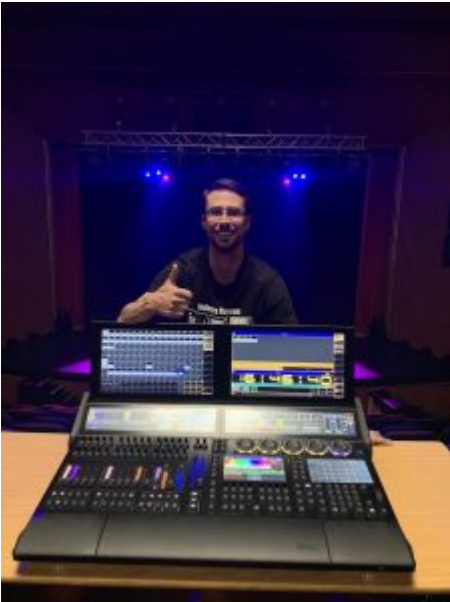
Thumbs up for MA3

Having experimented with the new grandMA3 light, the dual-encoders have proven to be a handy feature especially during programming, and according to Leon, the console works like a charm even in Mode 2. “The letterbox screens are features I don’t know how I ever did without,” he grins. “Having everything close by and adapting to settings during programming makes it a real pleasure to work on. Although I am still operating our shows in Mode 2, I have played around in Mode 3 and personally feel that the rotary knobs are going to be very useful. There is also a feature for assigning the path of travel for movers which I’m very excited about. Many productions are dependent on moving lights following a specific path when going from one cue to the next or even in loops or chases. In the past this would take me quite some time to set up.”