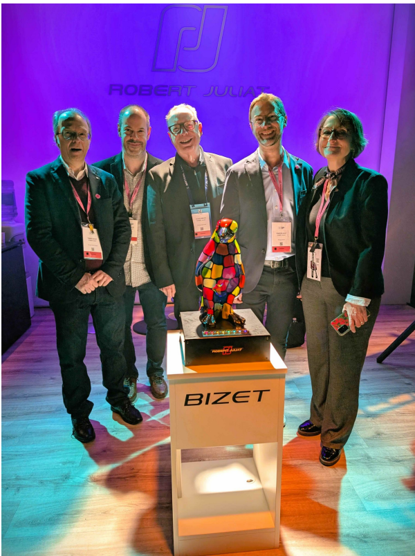
(Above): The Robert Juliat team on the ISE 2026 stand

In an exhibition the size of ISE it takes a lot to make an impression, but the new addition to Robert Juliat's Bizet family of profiles and Fresnels managed to do just that with the World Premiere of the brand-new Bizet 8-Colour Fresnel .