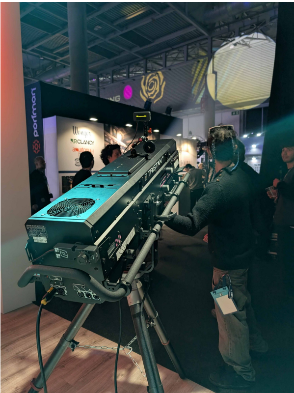
(Above): RJ's new Tristan followspot being tested by a curious visitor to the stand

Tristan and Morgane offer advanced new features that include, for the first time, a motorized iris which can be controlled remotely as well as locally. New mounting positions have been added to adapt photo-compatible accessories and, in particular, integrate a remote display that provides real-time information such as the iris size and light intensity directly on a display with a direct view of the light.