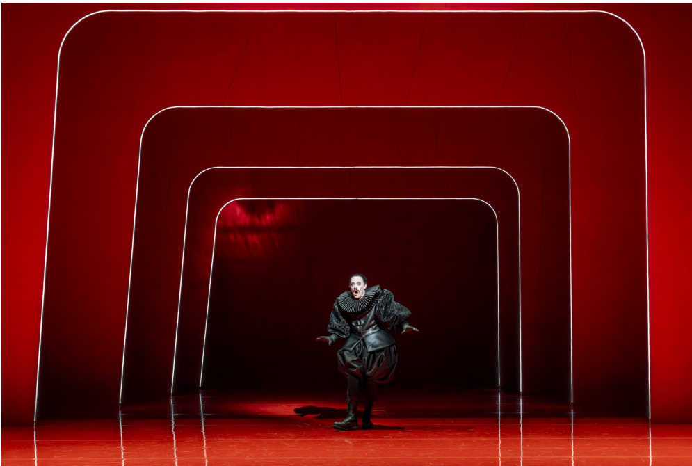
Theater Basel - Opera Macbeth by Giuseppe Verdi

Set in the centre of Basel, the Theatre, which also houses the 300-seat Small Stage, known as the Kleine Bühne, and the modern 450-seat Schauspielhaus (Playhouse), made its new followspot investment as part a continuous renewal of its lighting system, a plan which ensures it can always bring the best and latest technology to its productions.