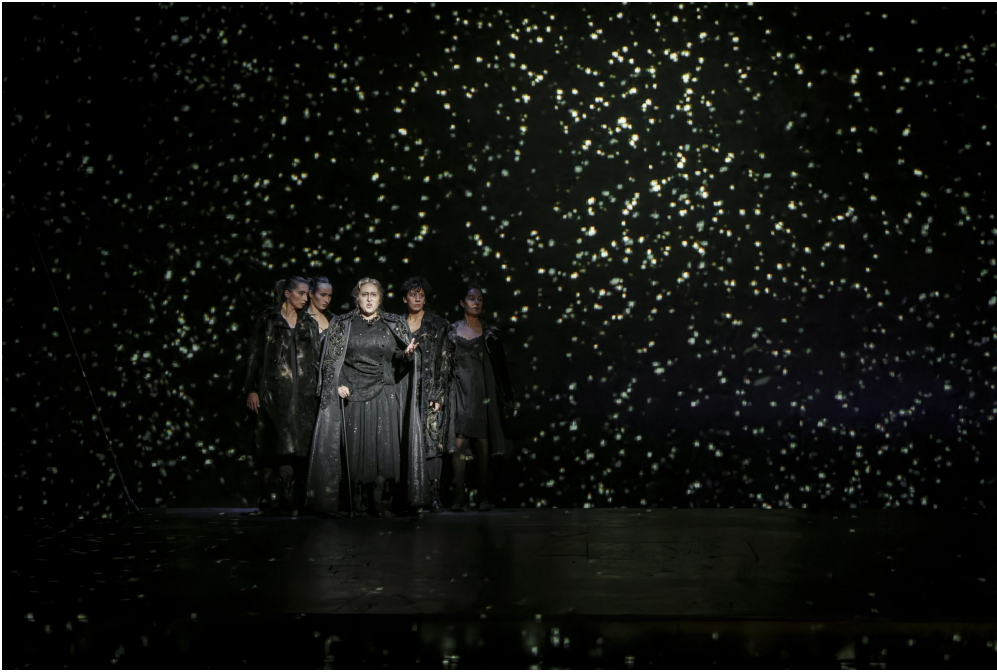
Theater Basel - Opera Die Zauberfloete by Wolfgang Amadeus Mozart

Two Arthur LT 4°-10° 800W LED followspots, which replace their 2.5kW HMI predecessors, are mounted on tripods to the rear of the Grosse Bühne auditorium. “With throw distances of 28m-40m, we needed something really powerful with a good optical system, and Arthur LT had all the capability,” confirms Hunziker.