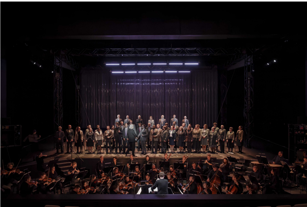
Photo: © Ingo Hoehn - Theater Basel - Opera Die Zauberfloete by Wolfgang Amadeus Mozart

The Theater's two Robert Juliat Tristan 7°-14.5° 825W LED followspots, with their unique new motorised iris, replace an existing pair of 1.2kW HMI fixtures. Unusually the Tristans are suspended from heavy duty Z-Decke truss on either side of the proscenium, from where they cover throw distances between 12m-23m. "We have a very steep angle and very restricted hanging space, so this was the only way to mount Tristan," says Hunziker. "Even so, despite its compact size, we also removed the front colour changer, but it's the perfect beam angle for this position. The handling is great, as are the brightness and dimmer.